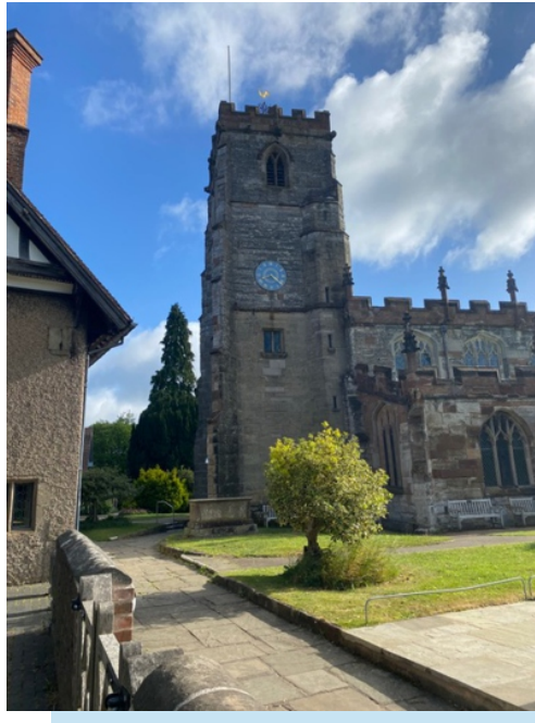
The view of the church from the Kenilworth Rd will not change.

In making these changes we will be following in the footsteps of many previous generations who have adapted the building to ensure that KPC remains a vibrant Christian presence in the village.