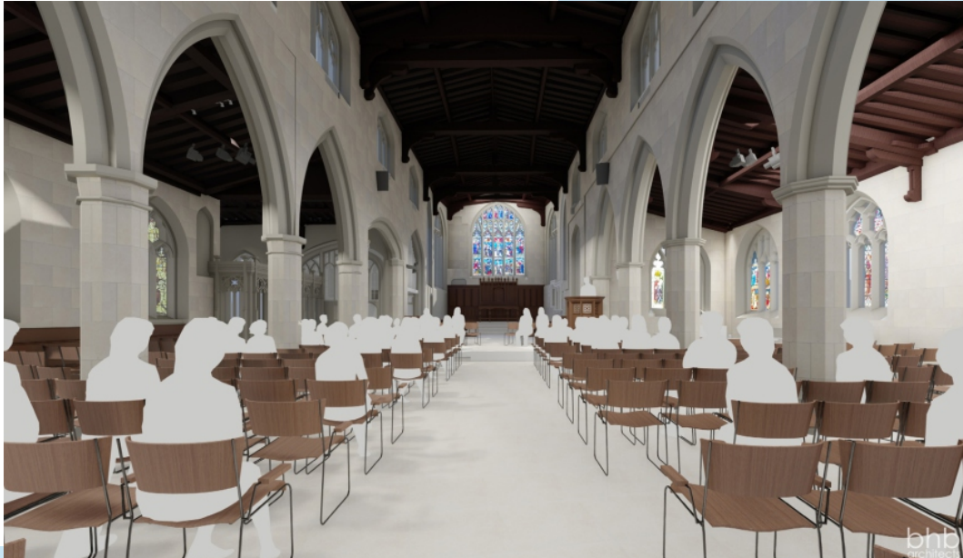
The proposed new seating and opening up the chancel will create a more welcoming and usable space.