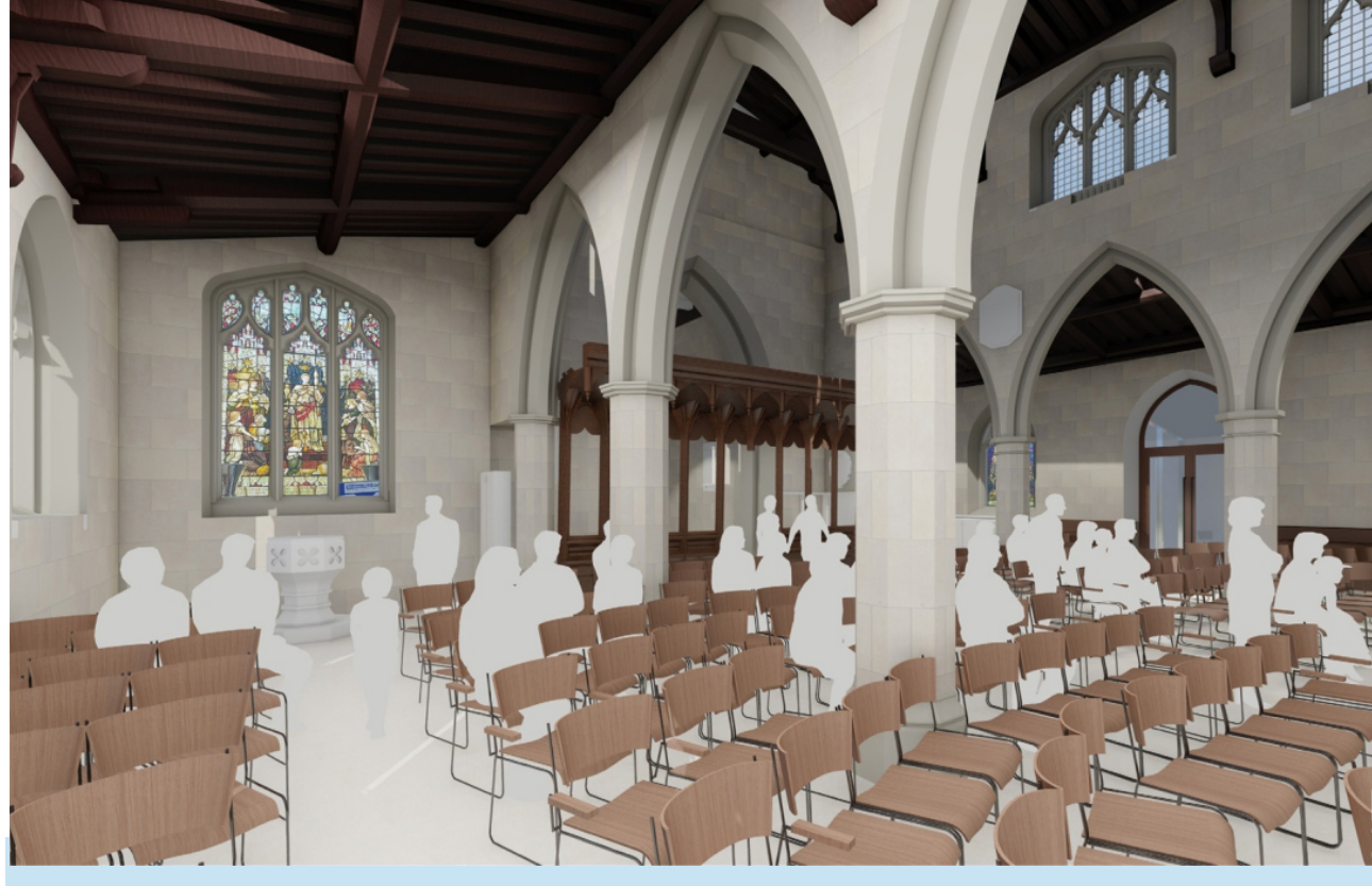
Proposed view from the south aisle showing the re-opened north entrance and rood screen